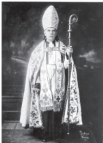
Bishop Francis Hodur

The Polish National Catholic Church mirrors the same organizational principles that Christ gave to the apostles. It possesses and safeguards the same faith that He deposited with them; it believes in the doctrine, governance and worship of the primitive Apostolic Church.