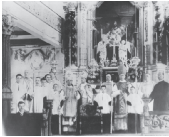
Bishop Hodur's consecration at St. Gertrude's Cathedral in Utrecht, Holland on September 29, 1907

Catholic Church spread to several sections of the United States of America and Canada.